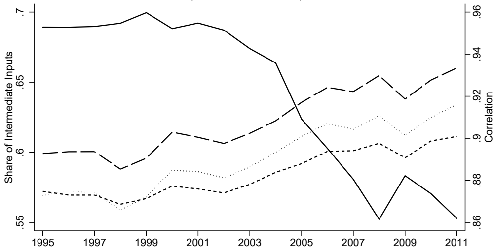
Figure 1. Share of Intermediate Inputs to Total Imports and Correlation between the Imports of Intermediate Inputs and Final Goods, 1995-2011